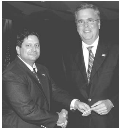
Florida TaxWatch President Dominic M. Calabro receives a congratulatory handshake from Governor Jeb Bush, following the Governor's signing of the Intangibles Tax repeal.

The Task Force made a number of recommendations, most of which were enacted into law by the 1998 Florida Legislature. These included phasing in an exemption for accounts receivable, exempting banks and insurance companies, and increasing the minimum amount due which required a taxpayer to pay.